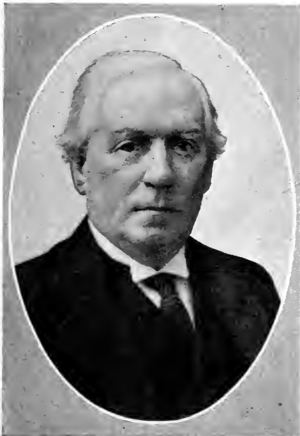
The Rt. Hon. H. H. ASQUITH, K.C., M.P.